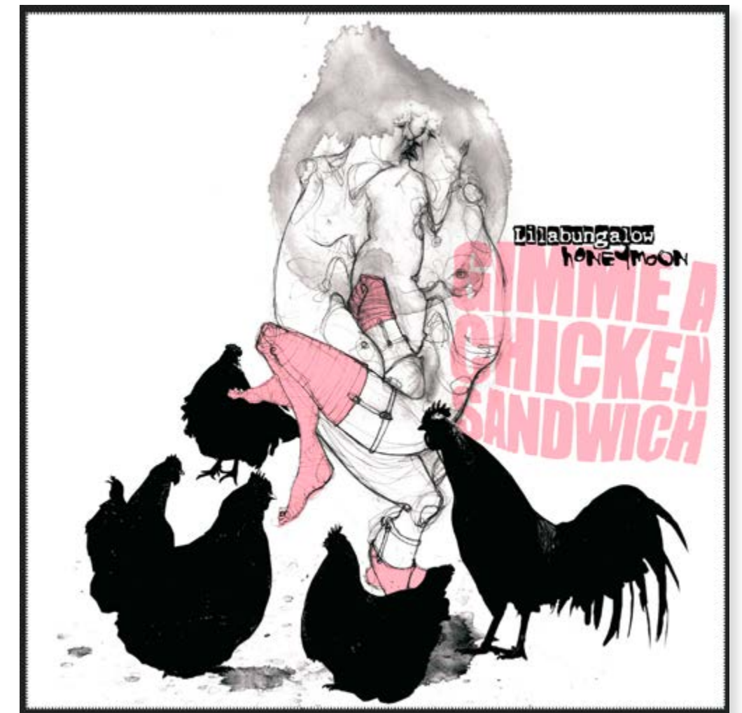
»Gimme me a chicken sandwich« - Promo EP (2008)