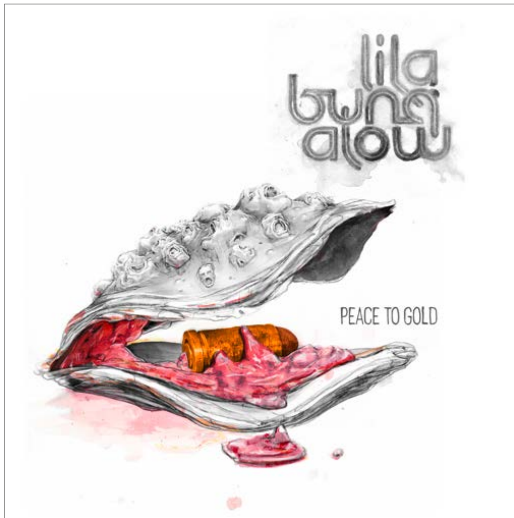
»peace to gold« (2015)